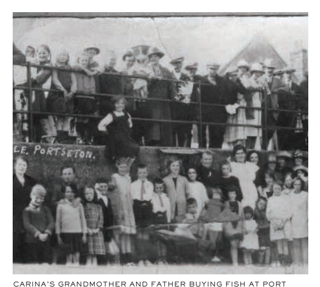
SETON HARBOUR, 1924.