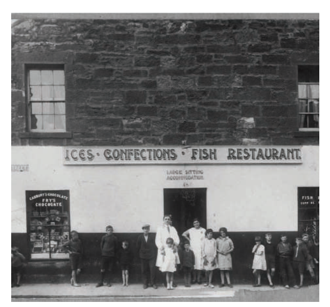
THE ORIGINAL COCKENZIE CAFE, 1919.